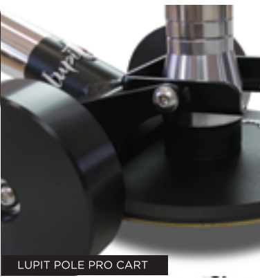
LUPIT POLE PRO CART