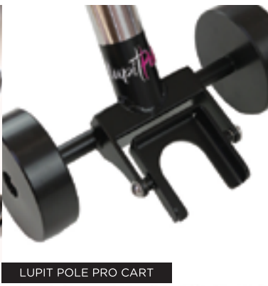
LUPIT POLE PRO CART